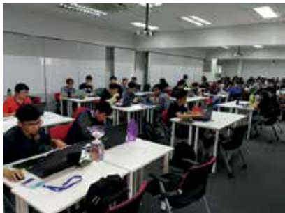
Students in Unicode competition

Personal growth ensures employability. Enjoy a head start in the job market.