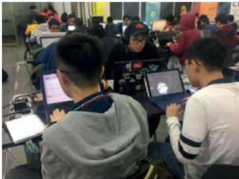
Hacks2Hire - Hackathon

Experience is a great teacher. Gain from industry exposure and learning innovations.