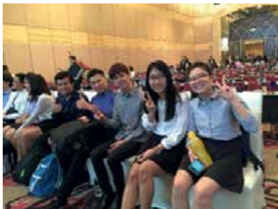
UOW Students attending CPA Congress 2017 at One World Hotel.