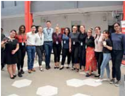
Students from UOW Wollongong campus on Study Tour to IICS