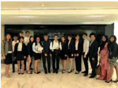
Employer project with IBM