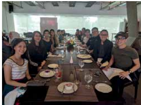
Practical class for Services Marketing