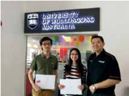
UOW Exchange scholars to Wollongong campus – 1 semester in Wollongong campus at local fees.

The world is your classroom. Widen your views to widen your prospects.