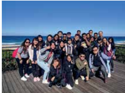
Study Tour to UOW, Wollongong Campus