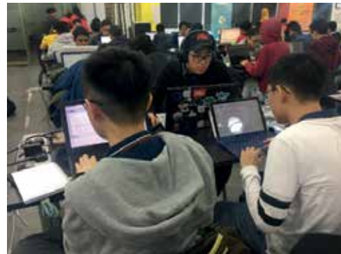
Hacks2Hire - Hackathon

Experience is a great teacher. Gain from industry exposure and learning innovations.