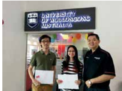
UOW Exchange scholars to Wollongong campus – 1 semester in Wollongong campus at local fees.

The world is your classroom. Widen your views to widen your prospects.