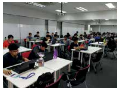
Students in Unicode competition

Personal growth ensures employability. Enjoy a head start in the job market.