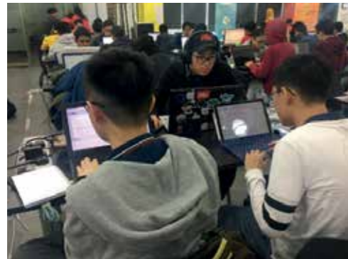
Hacks2Hire - Hackathon

Experience is a great teacher. Gain from industry exposure and learning innovations.