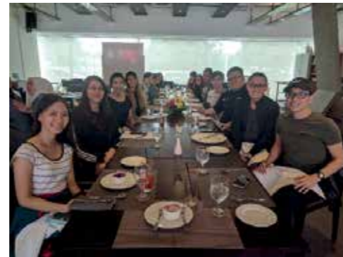
Practical class for Services Marketing