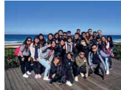
Study Tour to UOW, Wollongong Campus