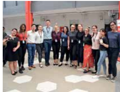
Students from UOW Wollongong campus on Study Tour to IICS