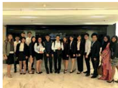
Employer project with IBM