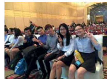
UOW Students attending CPA Congress 2017 at One World Hotel.