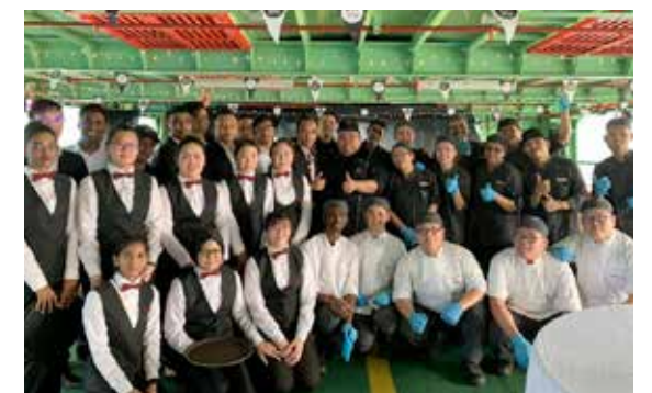
▼ FERRY FEASTING 2019