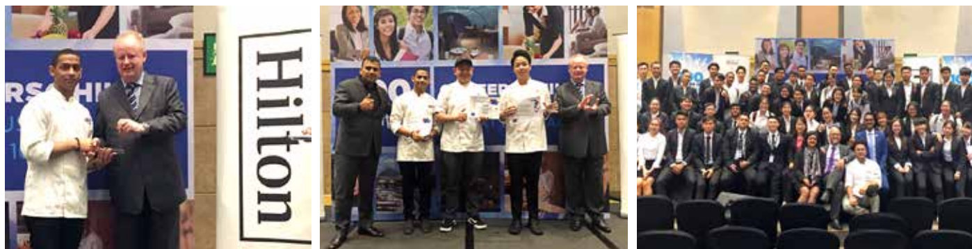
▼ HILTON CULINARY CHALLENGE 2019