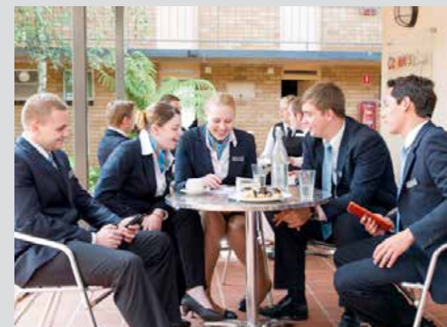
Students relax at Cookies Cafe