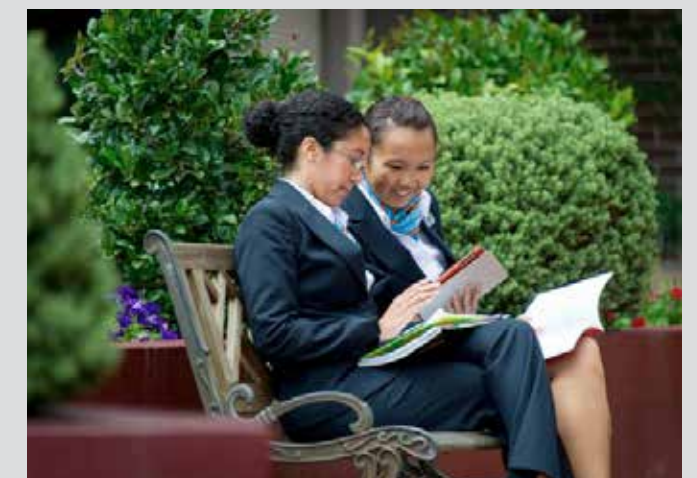
Leura campus courtyard