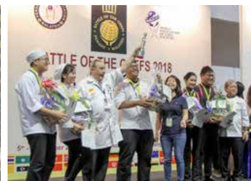
▼ BATTLE OF THE CHEFS 2018