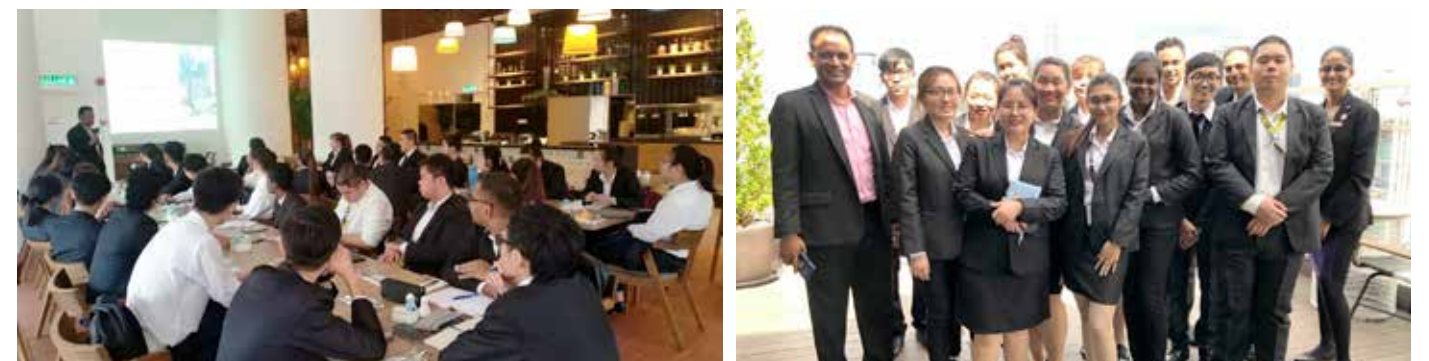
▼ HILTON BOOT CAMP