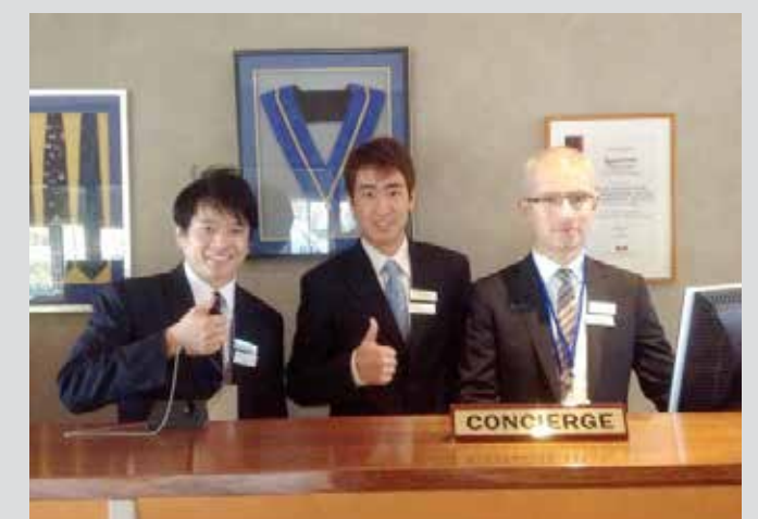
Practical training classes at Leura Campus