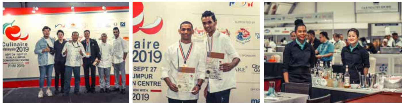
▼ FHM (FOOD & HOTEL MALAYSIA) 2019 COMPETITION