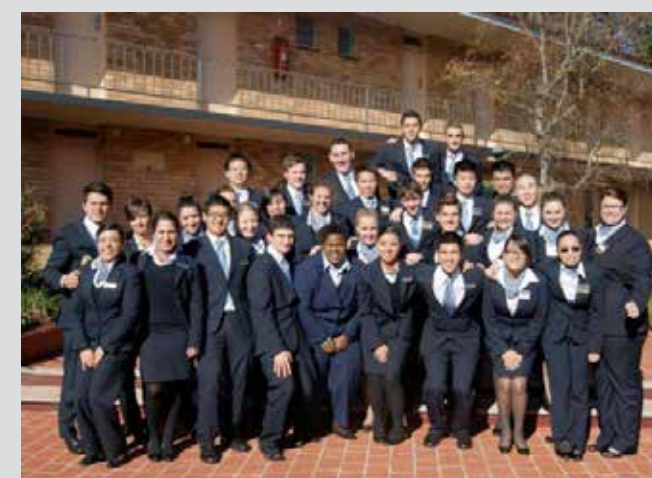
Students celebrating the end of term