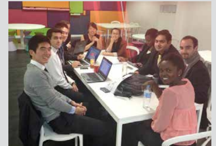
Student Representative Council (SRC)