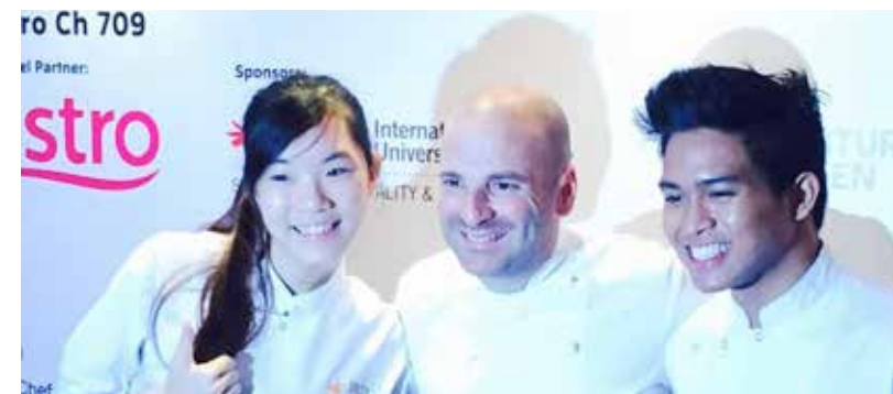
▼ STUDENTS PARTICIPATING IN MASTERCHEF AUSTRALIA IN MALAYSIA