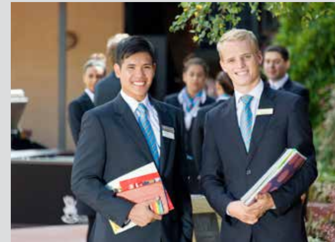
Courtyard between classes